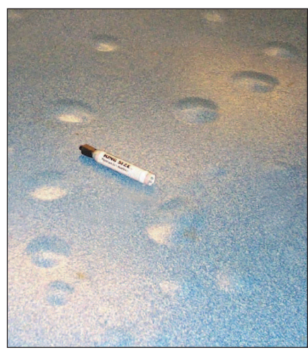
The effects of elevated pH levels can be seen in these examples of re-emulsified adhesive, soluble salts, and blistered floor coating.

barrier or retarder directly beneath the concrete can help reduce the amount of moisture available to contribute to such growth within or beneath a flooring system.