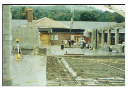
A vapor retarder placed under granular fill may trap rainwater, leading to such moisture problems as were later seen with this tile floor.

Some think that low water-cement ratio concrete can by itself satisfy the floor covering industry's moisture emission requirements. After sufficient drying, this can appear to be true. However once the floor is covered, moisture within the slab will redistribute itself such that if the flooring were removed and the moisture emission rate re-tested, a higher emission rate would be observed. In addition, without adequate subslab moisture protection, the total moisture within the slab will increase over time. Also, without con-