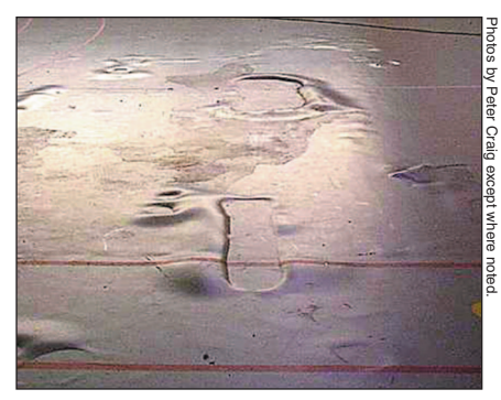
Moisture can have a devastating effect on floor coverings, such as this failed gym floor.

in concrete slabs has become such a problem, we must examine the sources