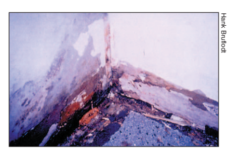
Mold problems affecting indoor air quality can begin with moisture migration through concrete slabs on ground.

barrier or retarder directly beneath the concrete can help reduce the amount of moisture available to contribute to such growth within or beneath a flooring system.