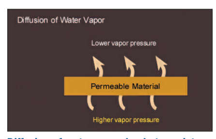
Diffusion of water vapor leads to moisture reaching the slab from below.

Table 1. Drying time, in days, required to reduce vapor emission to 3.0 pounds per 1000 square feet per 24-hours.